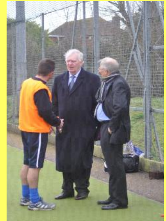
“Where I think you went wrong at Southampton ...”