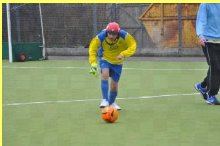
Stop this one Mum!