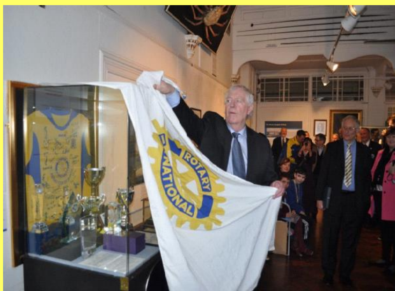
President of Special Olympics Lawrie McMenemy unveiling our memorabilia and trophy cabinet at the Bexhill Museum on Saturday March 28th 2015