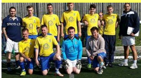
This is what a winning premierships team looks like