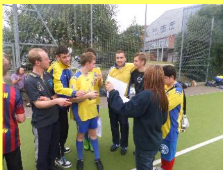
“When I count to three all sing in tune .. or I’ll charge you double next week!”