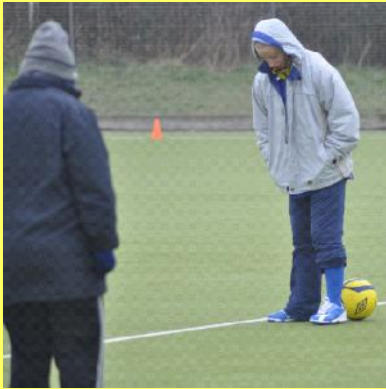
“To my feet next time—it’s too cold to chase it”