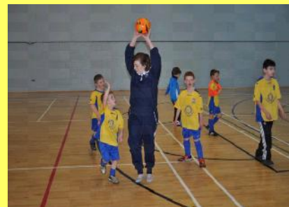
Can we have our ball back please?