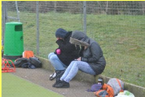
“ What’s the score?” “Dunno, can’t get a signal”