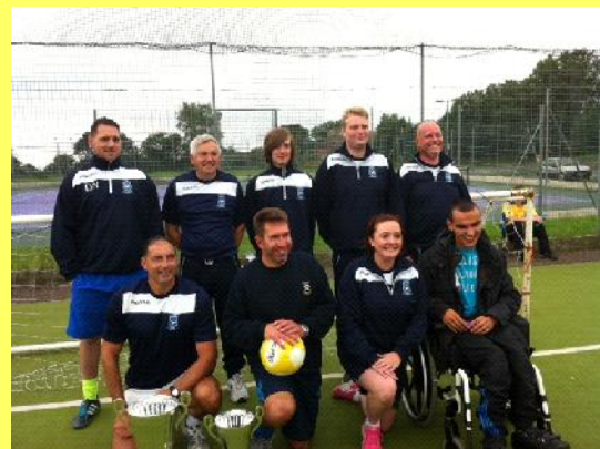
Why are they having their photo taken with the Cups? How many goals did they score?