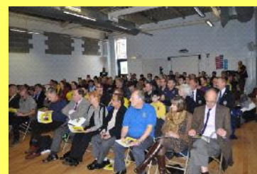
Another full house for the AGM