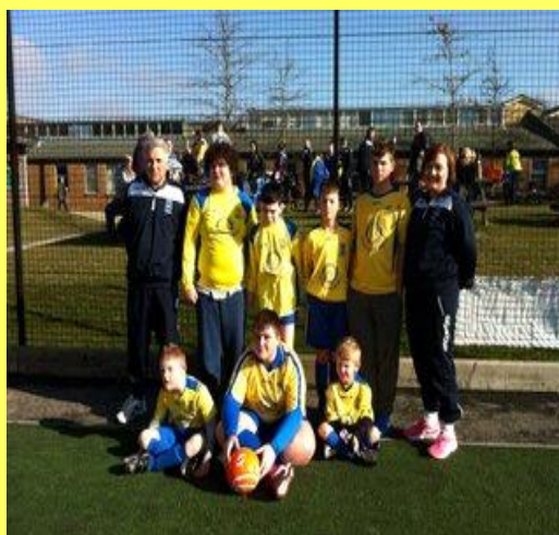
The 1066 Specials stars of the future

Thank you to everyone for all your hard work and support. Please let's keep it up and show other teams what the 1066 Specials are all about. But let us not forget that it's not all about winning (that's just a bonus) but having lots of fun and working as a team!