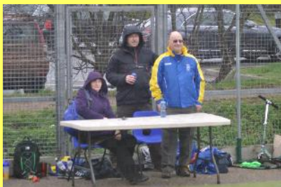
A cup of tea wouldn't go amiss, it's freezing out here.