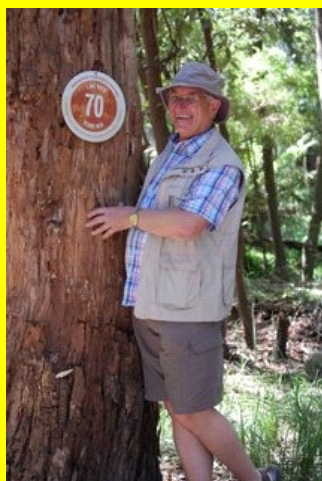
He's older than an Aussie tree!

News flash!!!! 1066 and all that... "King" 'Arnold Abdicates... Read all about it!