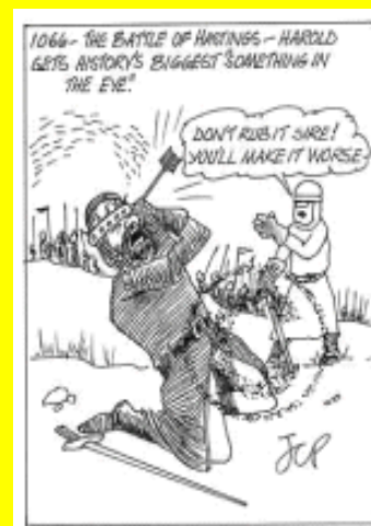
His eyes aint as good as they were!

News flash!!!! 1066 and all that... "King" 'Arnold Abdicates... Read all about it!