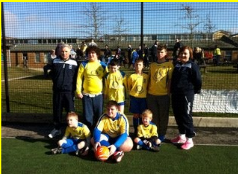
The 1066 Specials stars of the future—The Junior Squad 2014/15