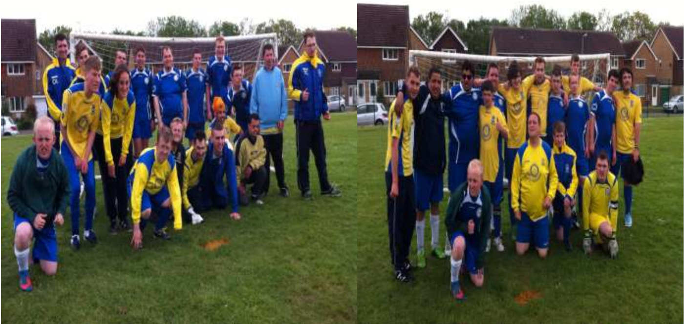
1066 Specials V Surrey Blues Teams (One and Two)

The afternoon had proved to be a delightful experience for both the participants and the spectators. The football was of a high standard but the real winners on the afternoon were sportsmanship and friendship. We look forward to the return fixture in Surrey this season to renew friendships and win back that trophy!