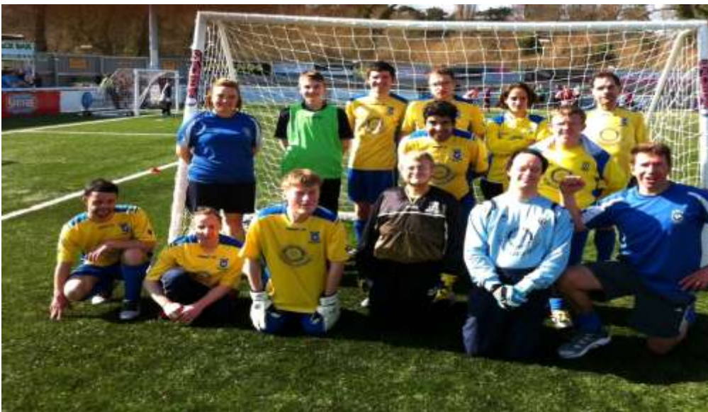
The 1066 Specials Friendly Squad

In all successful organisations leadership is important and necessary. Decisions do have to be made and strategies implemented. Unfortunately, in the real world it is impossible to please everybody all of the time. But it must be remembered that the 1066 Specials Football Club has developed spectacularly since its foundation in 2003, but there is still a long and exciting journey ahead. So, let us go forward together with a " can do" positive attitude, and most importantly, continue to simply put smiles on faces., 'cos ENJOYMENT is our aim!!!